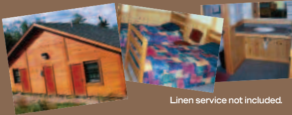
Linen service not included.

8 of these modern heated cabins come equipped per room with 2 bunk beds, dressers, and a full bath and shower. Perfect for any retreat, guests can have private accommodations or share with up to 4 guests per room.