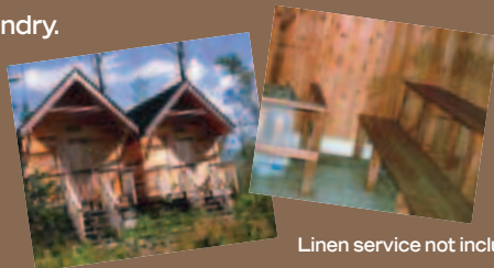
Linen service not included.

18 heated rustic cabins with a sleeping capacity of 8 each for a total capacity of 144. These cabins are adjacent to a central male shower facility with two saunas, a female shower facility with two saunas and a coin-operated laundry.